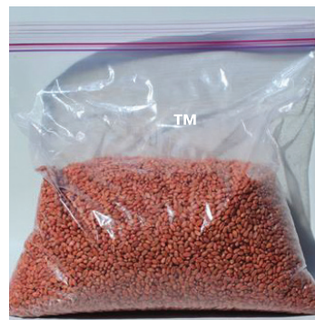
No dust off the seed. Sampled within one minute of application.