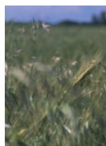
Wild Oat in Wheat

In the PNW, ACCase-inhibitor herbicide resistance has been detected in wild oat ( Avena fatua ) and Italian (annual) ryegrass ( Lolium multiflorum ). ALS-inhibitor resistance has been confirmed in brome species ( Bromus spp.). Jointed goatgrass ( Aegilops cylindrica ) may also become problematic as a result of limited available herbicide options (with over dependence on ALS-inhibitors). The key Syngenta wild oat and Italian ryegrass products are Axial™ (pinoxaden), Discover® (clodinafop-propargyl), Achieve® Liquid (tralkoxydim) and the broadleaf crop graminicide Fusilade® (fluazifop-P-butyl). A list of products used for control of the species referred to above, together with details regarding mode of action and herbicide class, is provided in Appendix 1.